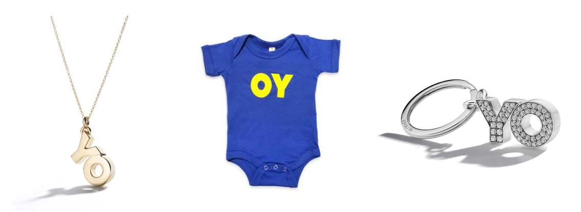
1. OY/YO Necklace available at IPPOLITA 2. OY/YO onesie available at the Jewish Museum 3. OY/YO Keychain available at the Brooklyn Museum

DK: Not everyone cares about art or thinks about it. But everyone needs a coffee cup or a tee shirt. The democratizing effect of merchandising isn't of interest to everybody but it is to me. It is a great way to disseminate content. Not many people can afford art, but they can afford a keychain. And how much do I love to see a baby in an OY/YO onesie?